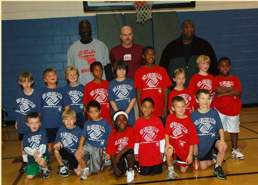
Junior Mite Challenge